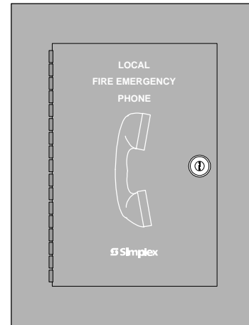
Cabinet Mounted Phone, Surface Mount