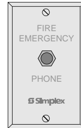
2084-9001 Remote Phone Jack Station