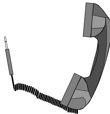
2084-9014 Pluggable Phone

2084-9024 Red Pluggable Phone, Push-to-Talk. This phone is the same as the 2084-9014, except it is equipped with a large and easily operated push-to-talk switch located on the inside handle between the receiver and transmitter.